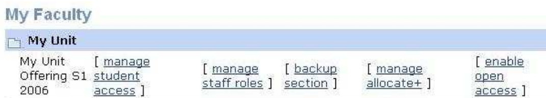
Figure 8: Current MUSO Manager User Interface

MUSO Manager was originally designed to allow authorised users to enrol staff and students into MUSO sections. In particular, the ability to allow the enrolment of a cohort of students from Callista was seen as the primary focus. Over time, as the service has matured, enhancements have been made to MUSO Manager to allow users to do additional tasks. The provision of user-driven backups, linking with Allocate+ and Open Access are just some of these enhancements. As each enhancement has been delivered, there has been a strong desire not to dramatically change the look and feel of MUSO Manager and so each new link in MUSO Manager was placed in line with the existing links. There are now five such links and, as can be seen in Figure 8, the space has become extremely limited.