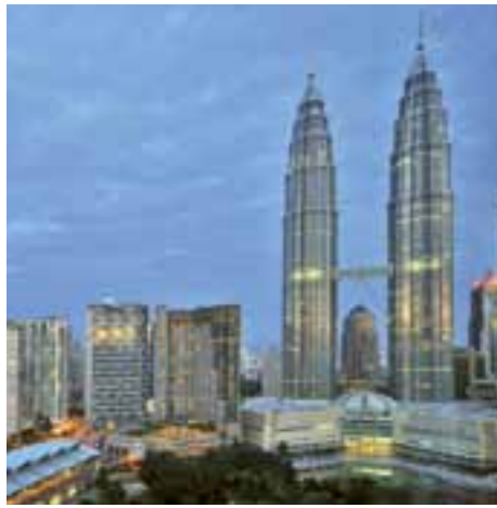
Kuala Lumpur, Malaysia