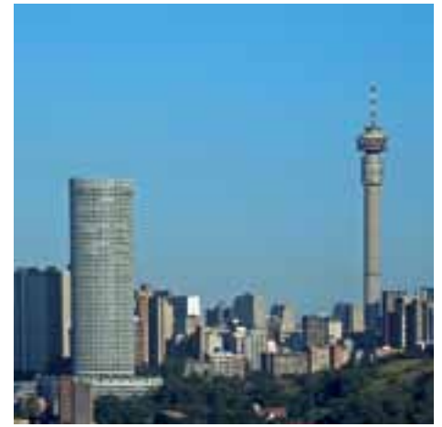
Johannesburg, South Africa

Every student that chooses to embark on exchange brings fresh perspectives and new cultural understandings to their new university. Equally, we aim to ensure that every student who comes to Monash on study abroad or exchange has an outstanding experience. Monash University is regularly ranked as one of the top universities in Australia, Asia and the world. We have an enviable reputation for academic excellence, and outstanding research credentials. Students who choose Monash can choose from our broad network of campuses.