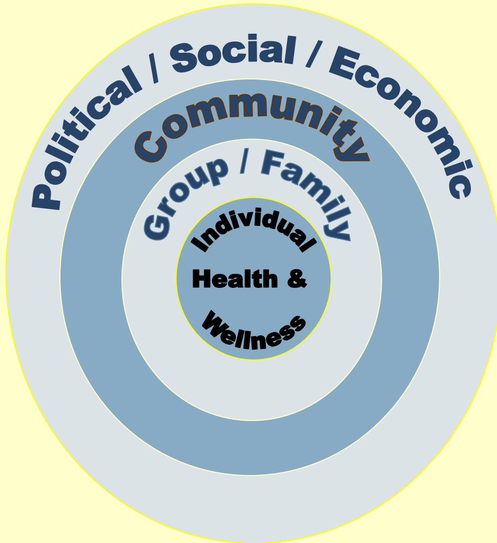
Primary Health Sector