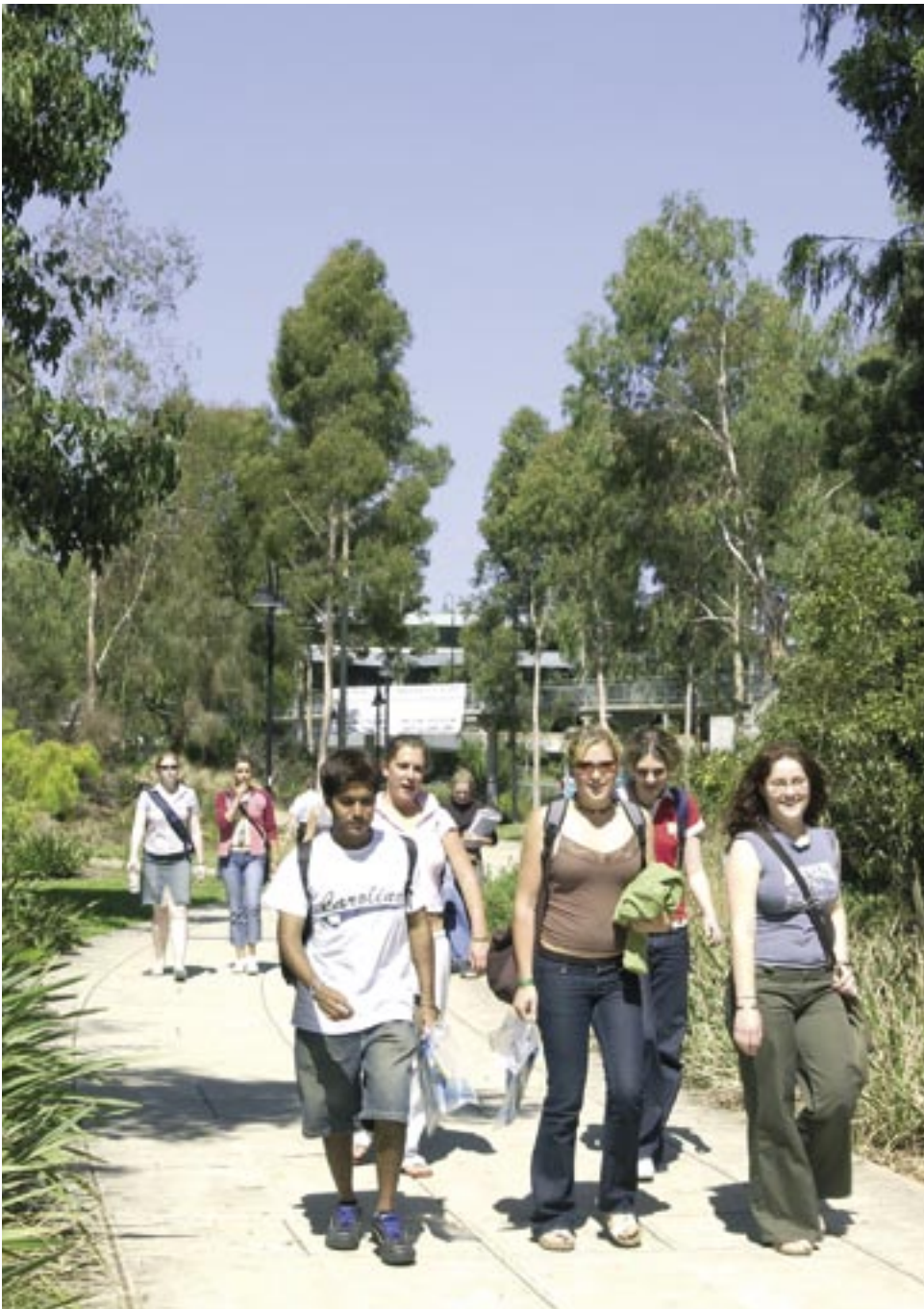
The Peninsula campus is set on 12 hectares of native landscaped gardens, providing a relaxing environment for students.