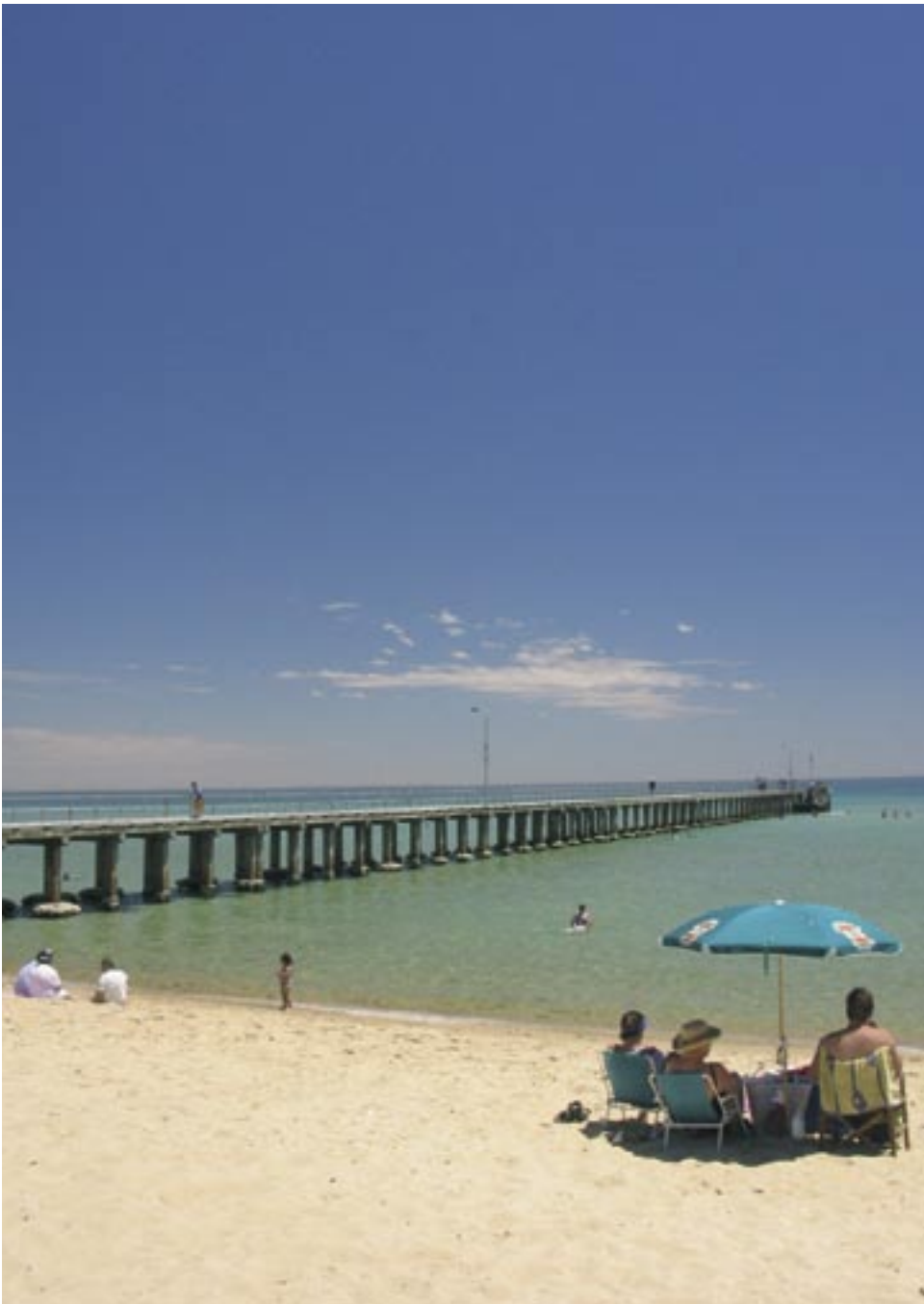
The Peninsula campus sits at the gateway to the beautiful Mornington Peninsula, with stunning beaches and opportunities for a range of water activities.

"The range of teaching opportunities this course offers is fantastic and gives graduates career flexibility that other courses don't offer. I am able to teach children aged anywhere from birth to 12 years."