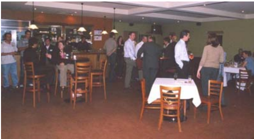
Above: IEEM Christmas Alumni, Racecourse Hotel Caulfield, November 2005